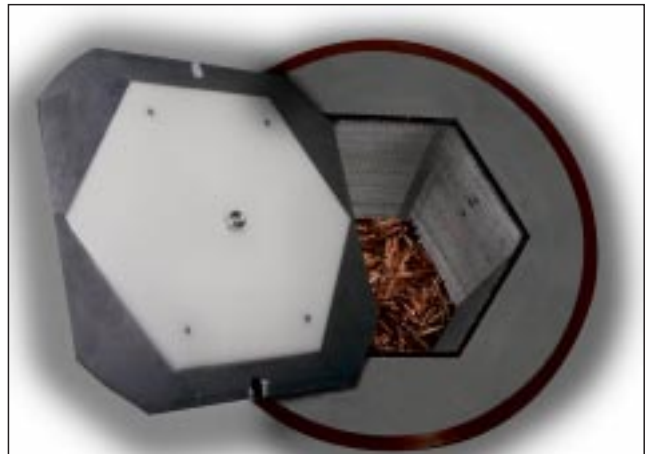
Custom Basket Shapes